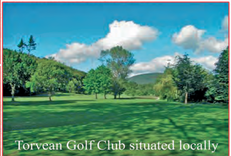
Torvean Golf Club situated locally