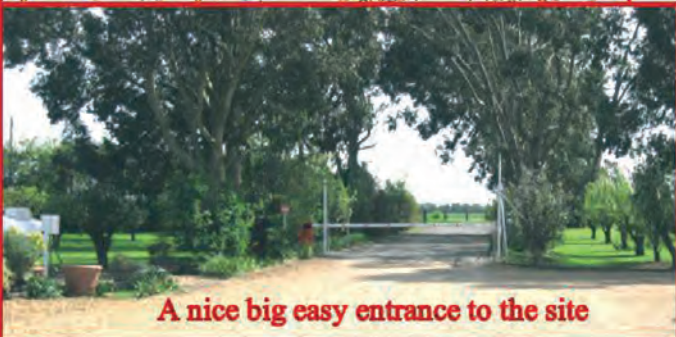
A nice big easy entrance to the site