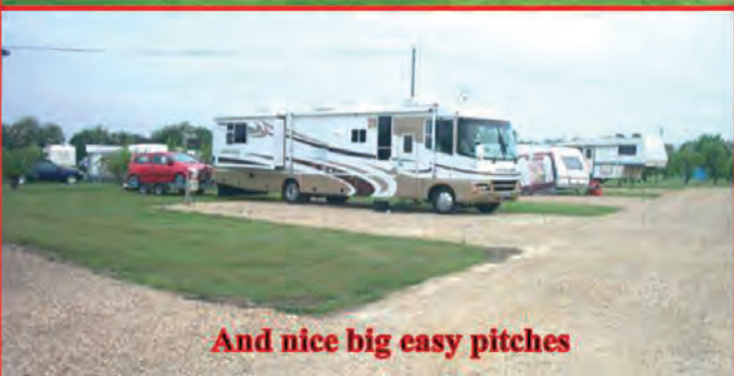
And nice big easy pitches