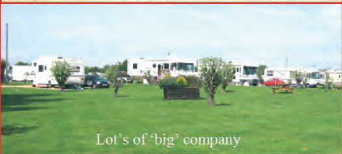
Lot's of 'big' company