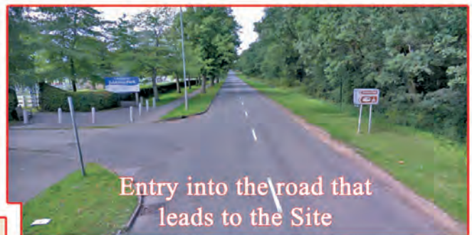
Entry into the road that leads to the Site