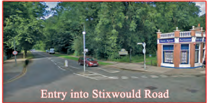
Entry into Stixwould Road

Woodhall Spa is a beautiful inland resort with an Edwardian character, set amidst magnificent pine woods. Regarded as one of Lincolnshire's most attractive villages, Woodhall Spa is famous for its peaceful and relaxing atmosphere, and with many fine hotels and guest houses it is the perfect location for a short break or holiday. The village has a variety of attractions including two top class golf courses, the unique 'Kinema in the Woods', Cottage Museum, Jubilee Park outdoor heated swimming pool and several aviation heritage sites associated with 617 Squadron (the Dambusters).