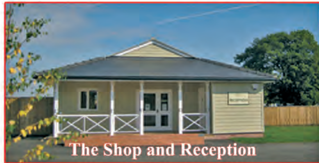
The Shop and Reception

From the South and West: I suggest heading for Sleaford to get onto the A153 heading for Tatteshall and Coningsby - then turn left onto the B1192 and follow the directions as above.