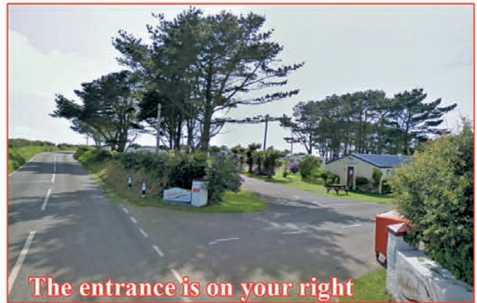
The entrance is on your right

Steve Richardson and his family visited this site in Autumn 2010 in their 32ft Itasca Sunseeker and reported that it was a very nice site but very remote - without a tow-car, you would really be stuck out on a limb! The site was immaculate with the best maintained grass that I have seen for ages - the RV pitches were massive. The toilet block was a bit dated but in keeping with the rest of the site they were very clean with ample hot water etc. There is a small but adequate enclosed dog-walk on site - the roads off-site were very narrow and busy with fast cars - no pavements!