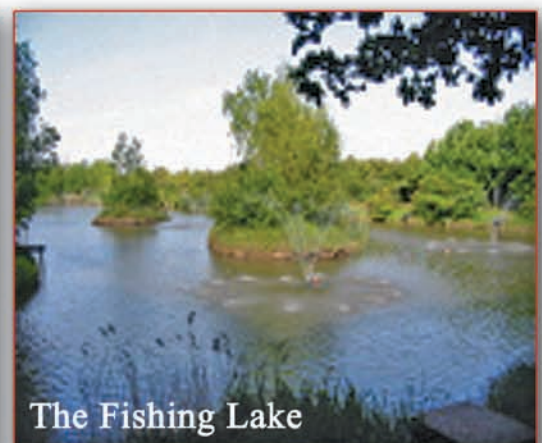
The Fishing Lake