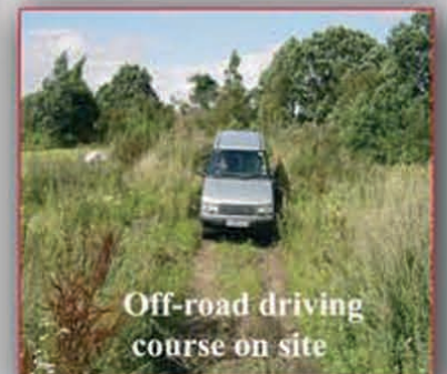
Off-road driving course on site